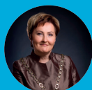
Aino-Maija Luukkonen Mayor, City of Pori

“PORI IS THE ENGINE OF FINLAND’S ECONOMY. IT IS A CITY WITH UNIQUE NATURE AND GREAT CULTURE AND SPORTS WITH FANTASTIC PEOPLE. I WANT TO WARMLY WELCOME ALL NEW STUDENTS TO FIND THEIR NEW COMFORT ZONES IN PORI.”